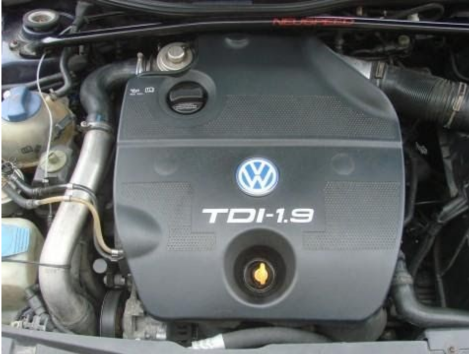
TDI ALH Engine Cover

Remove the engine cover. On many models this requires a 10mm socket to remove three 10mm nuts. They are located under the circular plastic caps in a triangle shape, they are visible in the above photo.